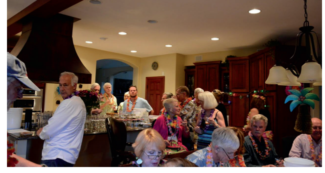
Capacity turn out for this year's event